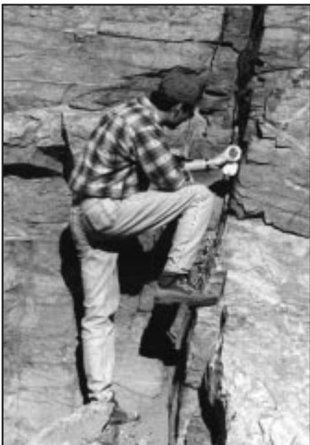
Colorado Geological Survey geologist measuring the dip and strike of a fault.