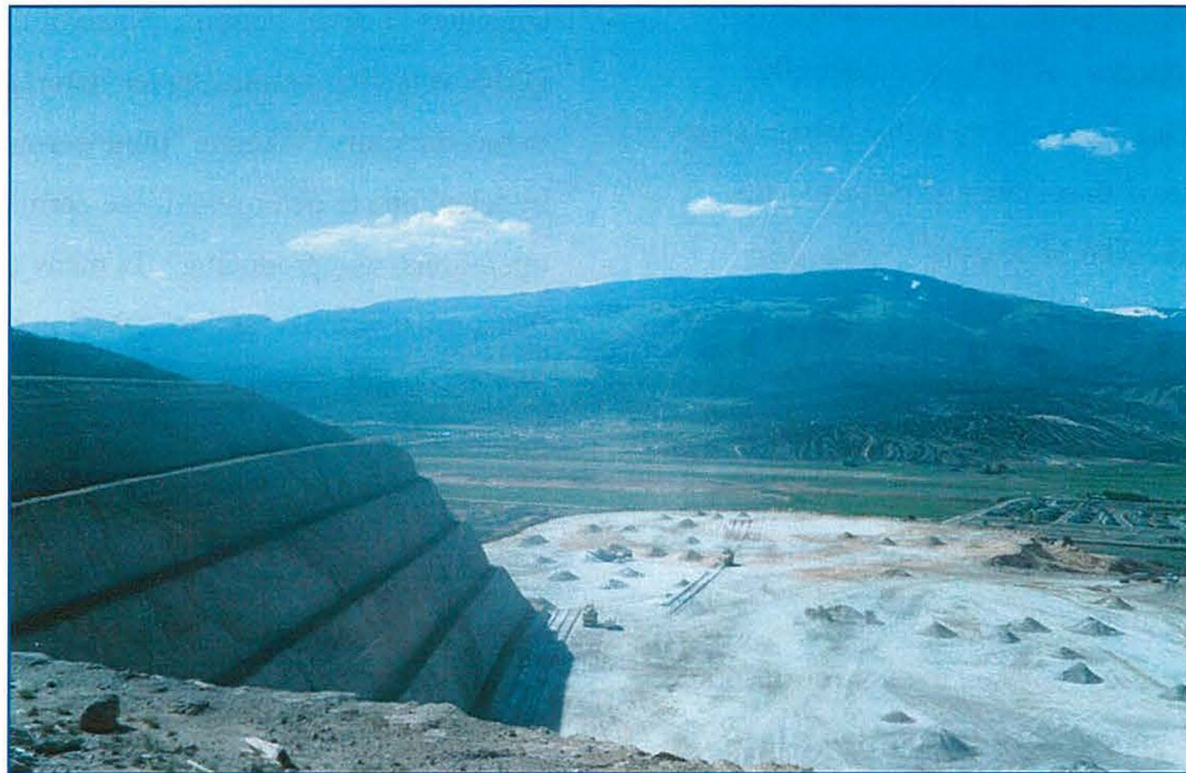
Eagle-Gypsum Mine, Eagle County

DOI: https://doi.org/10.58783/cgs.is68.gtnn2577